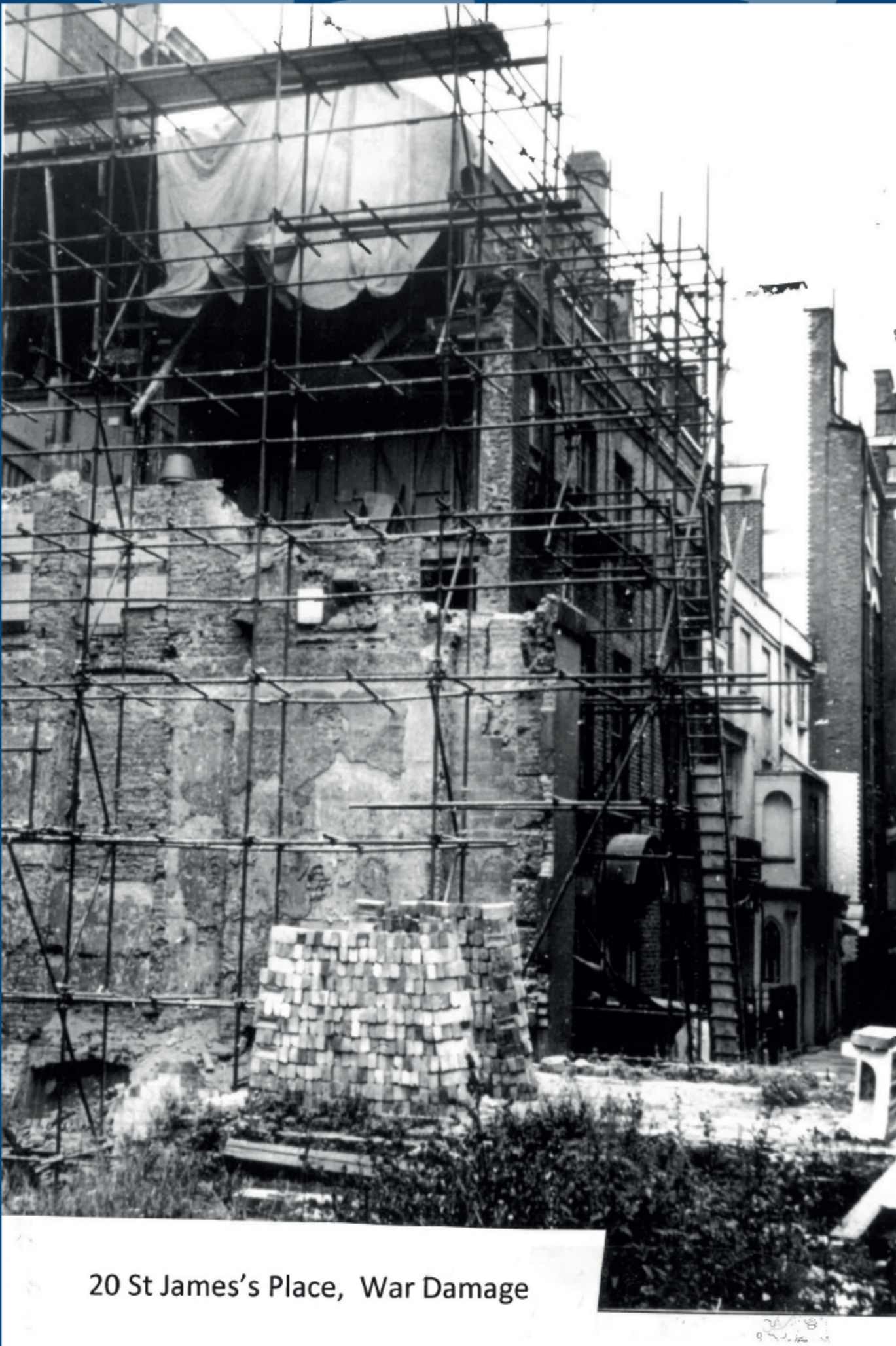
20 St James's Place, War Damage

1949 - For the first time, the Fastnet Race went West from the Royal Yacht Squadron line in Cowes, with Myth of Malham achieved victory by an impressive eight-hour margin over Bloodhound.