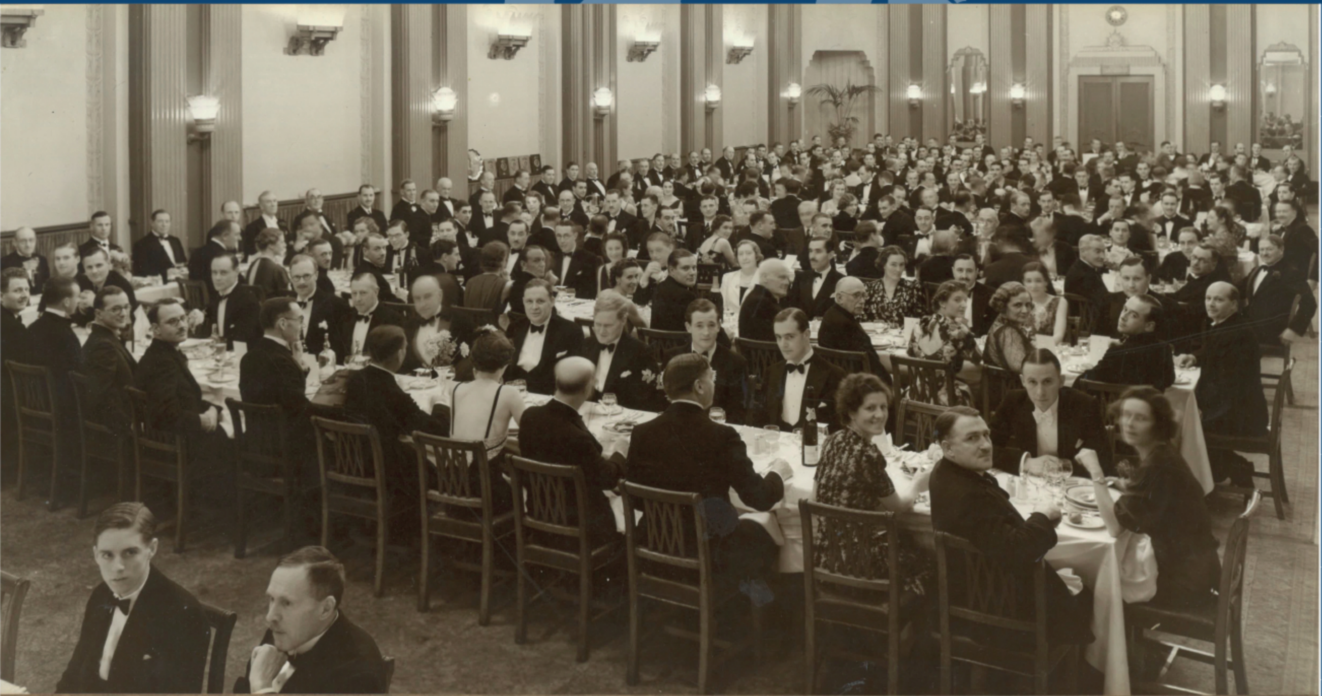
RORC Annual Dinner & Prize Giving held at Park Lane