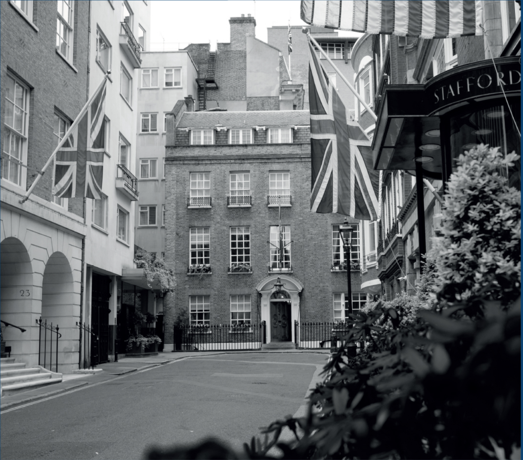
RORC London Clubhouse